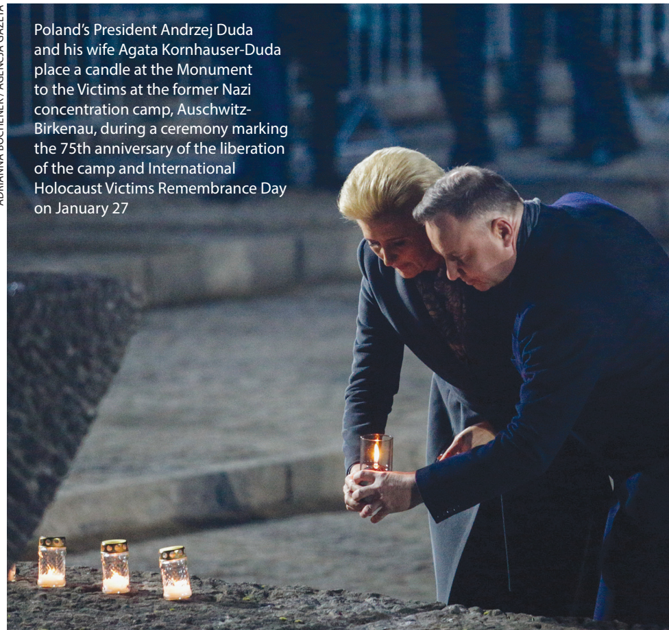
Poland's President Andrzej Duda and his wife Agata Kornhauser-Duda place a candle at the Monument to the Victims at the former Nazi concentration camp, Auschwitz-Birkenau, during a ceremony marking the 75th anniversary of the liberation of the camp and International Holocaust Victims Remembrance Day on January 27